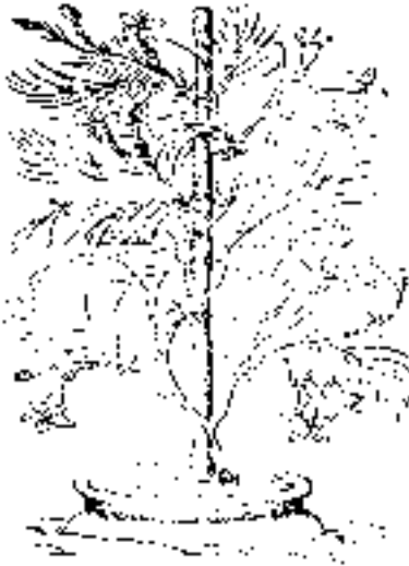
Figure 2. Cypress vine ( Ipomoea quamoclit ) growing in a pot sunk in the ground (Gerard, 1633).